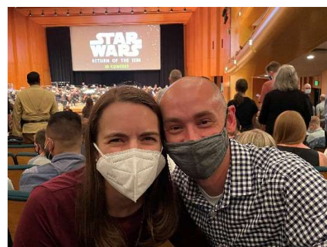
Dating during a global pandemic is no joke. But learning we thought similarly about the situation and being able to support each other in some trying and isolating times was a huge help to strengthening this relationship.